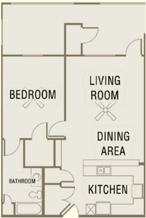
A2 860 Sq. Ft.* 1 Bdrm/1 Bath