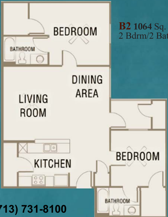
B2 1064 Sq. Ft.* 2 Bdrm/2 Bath