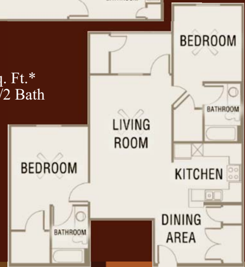
B5 1070 Sq. Ft.* 2 Bdrm/2 Bath